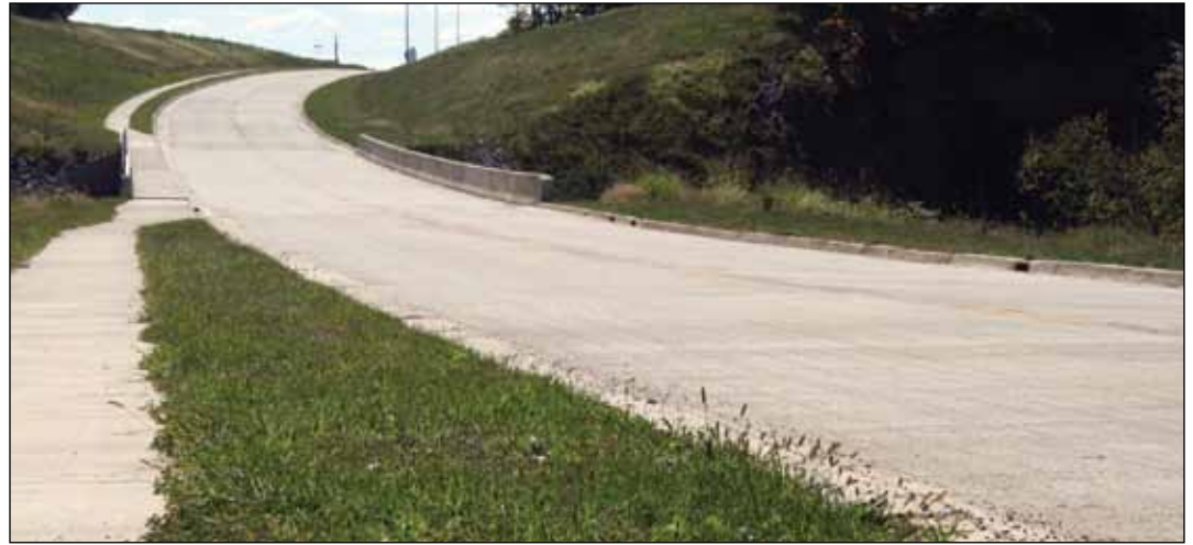
Three phases of the Outer Belt West project are now open. The new road connects Evergreen Avenue, Fayette Avenue, and U.S. 40.

The EMPG funds are utilized by states for a variety of emergency management programs.