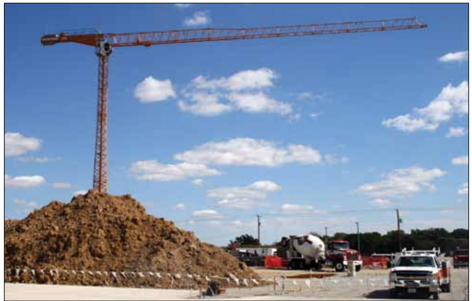
Construction continues on the new corporate headquarters for Midland States Bank. Construction is expected to be completed by Fall 2011.

Taking a look at additional industrial projects, the City assisted Bonutti Research with drainage improvements as part of their 4,640 sq. ft. expansion to their facility located in the Effingham Business Park and also assisted Mid America Motorworks with improvements to their complex. Sherwin Williams continues