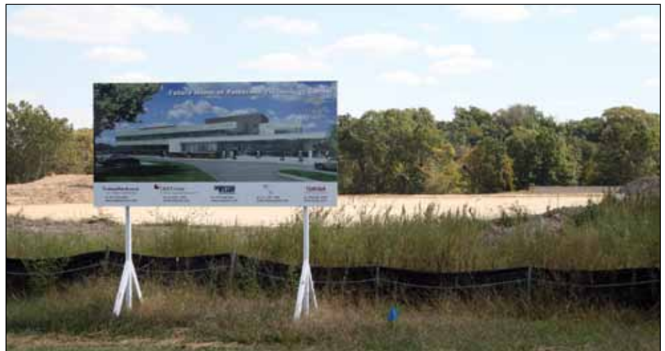
A site next to the Network Centre Hi-Tech Park was selected for Patterson Companies new complex.

to make major improvements to their 1.2 million sq. ft. distribution facility as part of the retention project which was approved in 2009. The City also recently worked with Solix CMR with the location of a call center in the Network Centre Business Park and sold a lot in the Effingham Business Park to Xtreme Seeding for their new 4,800 sq. ft. facility.